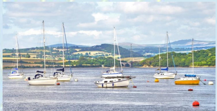
The view towards Dartmoor from Brunel Green