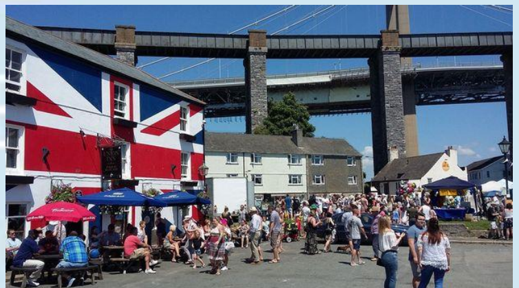
Regatta Day at the waterfront